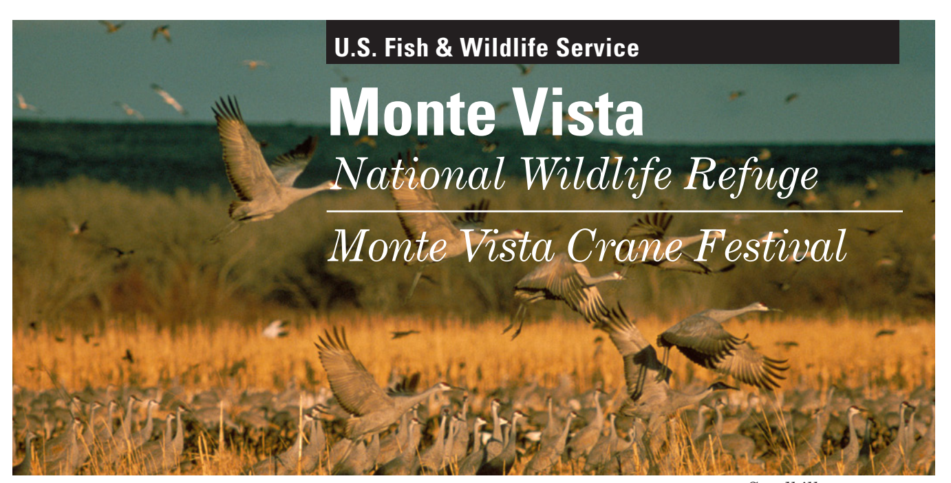
Sandhill cranes